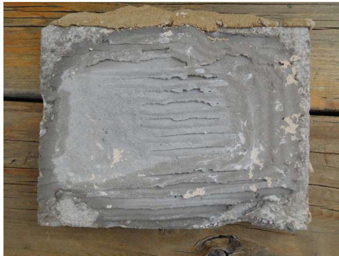
Figure 4: Mortar Setting Bed Near Top of Second Panel

At both panels, the remnants of two different colored paint coatings were observed on the tilt-up concrete surface and adhered to the setting mortar on the back faces of many of the units (Figure 5). The coating from grade to about six feet above grade appeared to be shade of violet and above six feet the coating appeared to be a shade of white. The shades and patterns appeared to match those shown in the pre-renovation photographs of the building exterior (Figure 6). The coating near the top of the wall appeared to be in better condition and was better bonded to the concrete