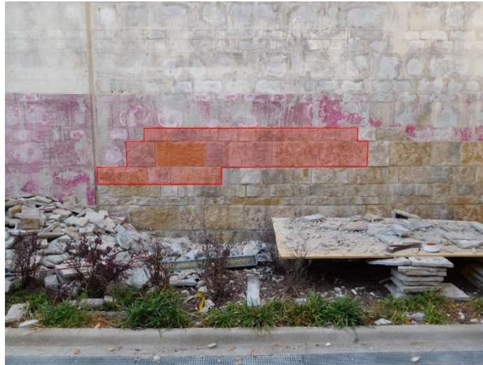
Figure 3: Area of Veneer that Fell as a Unit

units that came from the top portion of the panel (Figure 4). At the upper portion of the panel, much of the panel surface was still covered with remnants of setting mortar, indicating a combination of adhesive failure at the substrate and cohesive failure of the mortar. The condition of the setting mortar and observed failure modes became similar to those at the failed panel as the work progressed down the face of the wall.