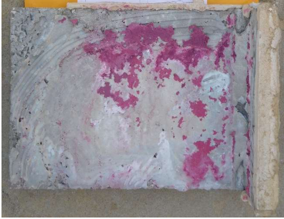
(a) Violet-Colored Paint

backup whereas the coating near the base of the wall was flaking off at many locations and would often come off with the unit.