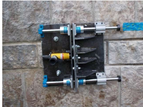
(b) Apparatus Mounted to Wall