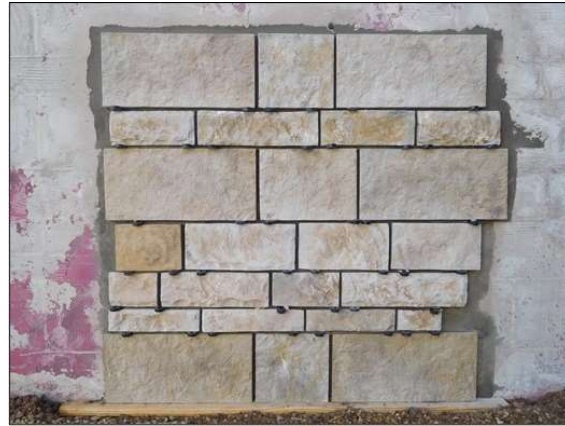
(b) Installed Mockup Panel