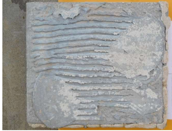
(b) White-Colored Paint