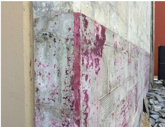
(a) Paint Remaining on Backup after Demolition