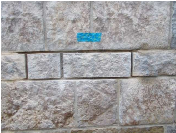
(a) Joints Removed Around Specimen

These test results fell significantly below the prescriptive code-required minimum shear bond strength of 345 kPa (50 psi) for AMV systems. The field investigation revealed that the principal cause of the veneer failure was improper preparation of the substrate surfaces. Large, voided areas in the setting beds were also a significant contributing factor in the veneer bond failure. The field testing of the AMSV panels showed that the average shear bond strength of the veneer units was significantly lower than the code-prescribed minimum values. Based on these results, it was recommended that the existing AMSV units be completely removed and replaced, the precast concrete panel surface prepared, and the AMSV replaced.