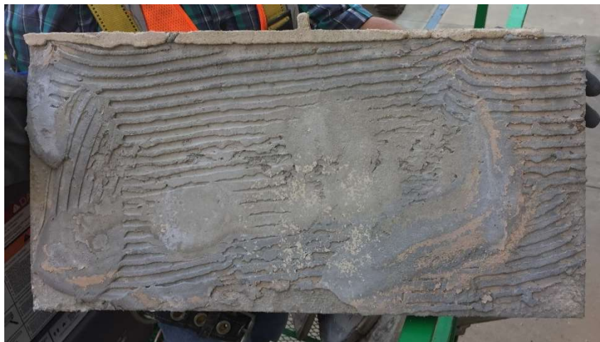
Figure 2: Comb Pattern and Voids at Setting Bed Mortar

The units removed during the initial stage of the investigation generally separated from the backup with the setting bed mortar still adhered to the backs of the units, indicating an adhesive failure at the substrate. A distinct comb pattern was visible in the setting bed mortar at all of the units (Figure 2), indicating that the units had been installed using a thin-set installation method but with insufficient pressure during setting for the mortar to spread and fill all of the voids. Significant voided areas were present on many of the units, particularly the larger units (Figure 2).