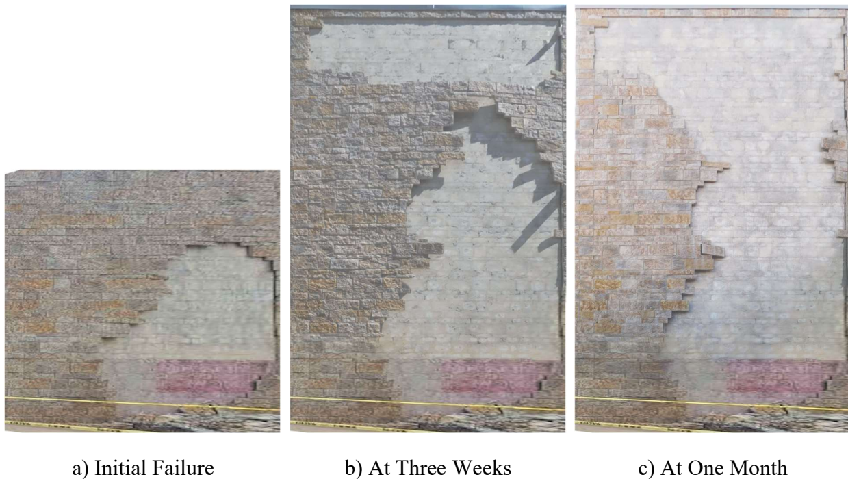
Figure 1: Veneer Failure Progression

The project was located at a large theater structure in the southern United States. The exterior walls of the structure were constructed of reinforced concrete tilt-up panels. A complete remodel of the building was performed in the early 2010s during which the exterior paint was to be removed from the panels and replaced with an adhered manufactured stone veneer (AMSV) assembly. During the renovation, AMSV was installed on a total wall surface area of approximately 1,510 m 2 (16,200 ft 2 ). The AMSV units varied in size from approximately 150 cm 2 (24 in 2 ) to 1860 cm 2 (288 in 2 ). Approximately seven years after installation of the AMSV, portions of the veneer at one of the panels began to separate from the substrate and progressively collapse over the period of a month (Figure 1). Luckily, no persons were harmed during the veneer failure.