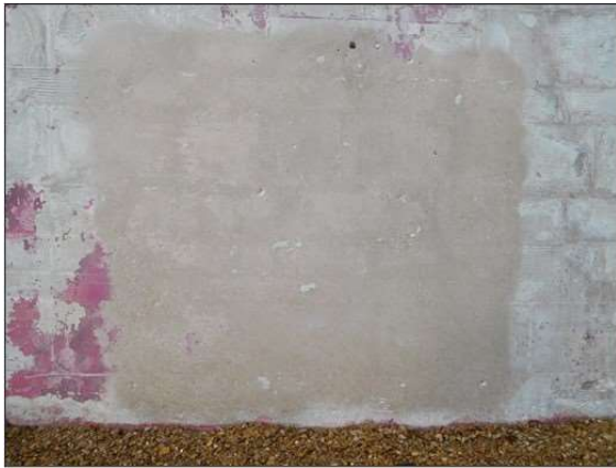
(a) Substrate Preparation

Eight specimens were tested: two whole units and three units that were each divided into two specimens. Overall, the total sample area included in the 18-day tests was approximately 3050 cm 2 (473 in 2 ). The area-weighted average gross bond strength of the 18-day tests was 356 kPa (51.7 psi), with half of the test samples falling below the code-prescribed 345 kPa (50 psi) minimum value. Since half of the test specimens did not meet the code requirements during the first round of mockup testing, a second round of quality assurance testing was performed after the mortar had cured for a minimum of 28 days.