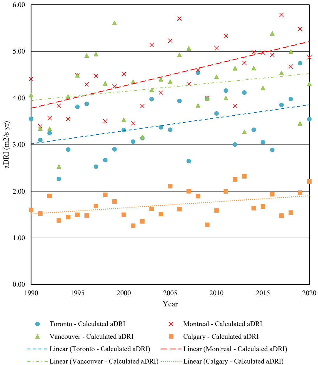
Figure 1: Recent trends in calculated aDRI (adapted from [3])

Buildings and Core Public Infrastructure [14] indicates that annual precipitation and windspeed are both projected to increase under multiple climate change scenarios. The list of locations for which an aDRI value is provided should also be revised to ensure adequate guidance is available for major urban centres.