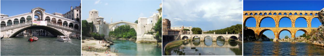
Figure 1: a) Rialto, Venice, 1591, b) Mostar, Bosnia - Herzegovina, 15th c., c) St Angelo, Rome, 134, d) Pont du Gard, France, 1st c.

represent ca. 40% of bridges and reasonable information and guidelines are available for their assessment and maintenance. In the US masonry arch bridges represent less than 1% of the bridge stock, built during the industrial revolution and up to the 1920 with very few available guidance. The only country where masonry arch bridges are still widely built is China, with up to date design guidelines and construction knowledge.