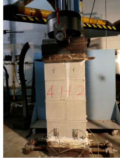
(b): Photo of test setup