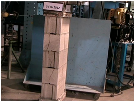
(a): Web crack formation just before failure

The prism with h/t of two (two-course high prism) failed in a different mode. Like prisms with other h/t values, vertical web cracks initiated however, they propagated little. Rather, the top course slid against the bottom course through the mortar joint (Figure 3b). This was observed in both the stack pattern and running bond prisms of two-course high. Hence, this study found that two-course high prisms do not fail in the same manner as other (higher) prisms.