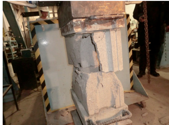
(b): Sliding shear conical failure mode