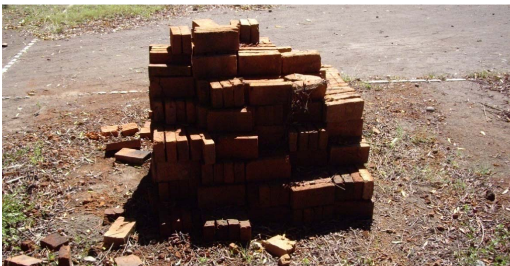
Figure 4: Handmade Indonesian Brick in 2008

Bricks are common construction materials for many countries including, Indonesia, Thailand and the USA. In Thailand, brick is the structural element for many archaeological monuments, sacred architecture, historic temples and some residential buildings in the last few hundred years. In the past hundred years, brick were used to build temples or palaces only, while common houses or buildings were built from timber. In Indonesia, bamboo was the common building material for housing and some evidence still exists with old bamboo houses, although the majority of houses are now made of masonry, usually handmade and usually red, really following the Dutch practices, as shown in Figure 4. However the real problem is one of safety for masonry in earthquakes [14] for all masonry, but particularly for soft poorly fired brick.