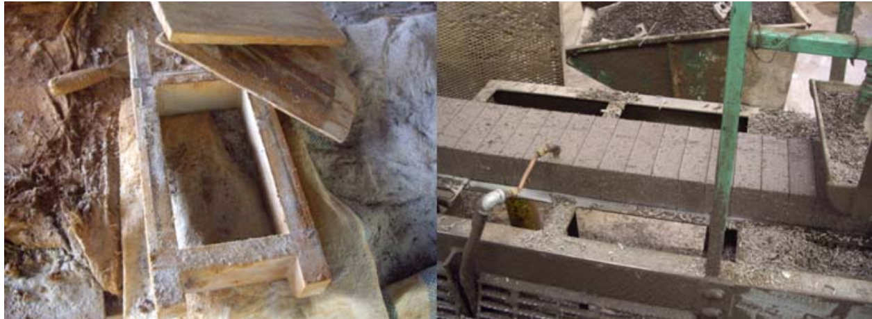
Figure 5: Handmade versus Machine Made

In terms of early twentieth century economics, there were limited reasons to compare the operation of a modern brick plant to a handmade operation. Figure 5 contrasts the two operational methods, between Indonesia and the USA.