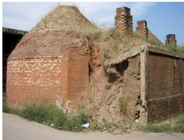
Figure 2: Wood Fired Thai Brick Plant in 2009

The second plant is located in Thailand. Figure 2 shows the brick plant in Thailand. Thailand has both types of plant, both handmade and modern tunnel kiln, in one way highlighting the economic development differences between the two countries.