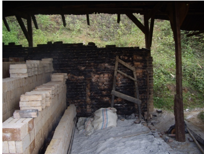
Figure 1: Indonesian Brick Plant in West Sumatra in 2008

Brick produced in beehive kilns were discussed extensively by Baker in terms of measured properties in the early nineteenth century [4, 12]. Hausler [13] documented the damage to masonry structures in several of the major fatal earthquakes in Indonesia in the last few years. In a recent field trip with the second author, she arranged a tour of two typical Indonesian brick plants. This paper documents the results of the field trip and compares the Indonesian practices to Thai and US practices. This paper uses three brick plants to compare the practical difference in manufacturing bricks in the three countries. The first plant is located about 50 kilometres NE of Padang on Sumatra, Indonesia. This limited operation uses manual and animal labour to produce brick, fired with rice hulls. Figure 1 shows a small-scale Indonesian brick plant.