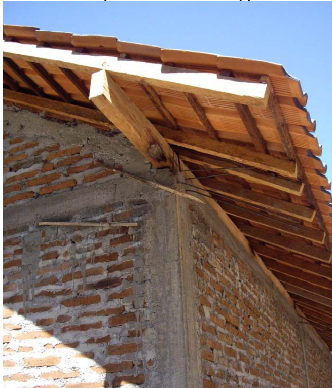
Figure 9: 100 mm RC Framing System in Indonesia

to act as a bond beam and columns for the brittle masonry, providing adequate time for evacuation of the residents in an earthquake. This method appears to be effective and economic.