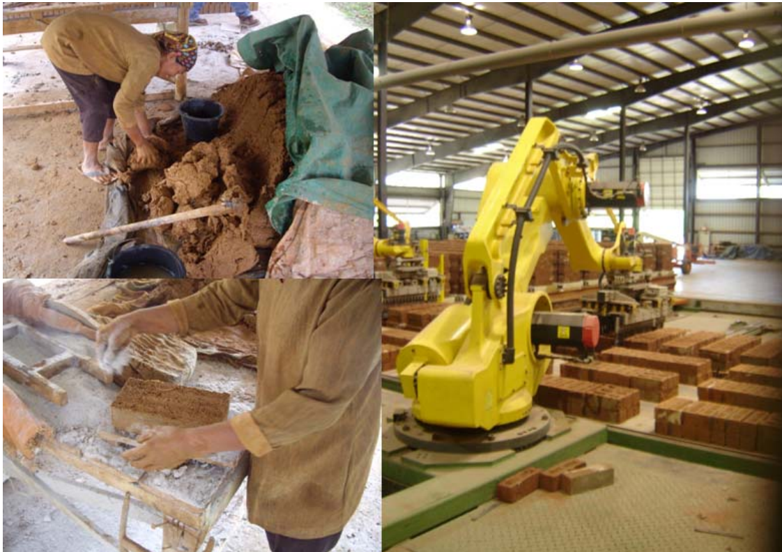
Figure 6: Hand versus Machine Handling

extruded bricks typically with holes and repressed extruded bricks. The stiffness and strength of the brick generally increases as the method moves from pressed to repressed brick [12]. However, the significant changes in the perception of the environmental impact of greenhouse gas emissions means that an economic trend is to consider the complete economic cost to the world for a unit's production irrespective of the type of the unit. Three critical aspects highlight the economic and manufacturing differences in the plants. The first aspect is the moulding of the bricks. In terms of moulding methods, the environmental issue is the non-renewable energy used in the modern plant for moulding. The second aspect is the difference in the handling techniques. Figure 6 shows the differences in the labour, between SE Asia and the US.