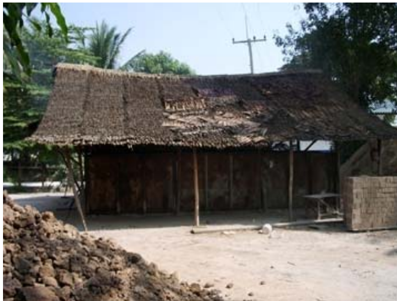
Figure 7: Simple Kilns in SE Asia in Thailand

The systems all take a wet clay-shale mix and develop a rectilinear brick that is easily handled. The differences are in the handling systems within the factories and the method of firing, which results in US plants that can produce 100,000 bricks per day and a small Indonesian plant that can produce 700 bricks per day. Baker and others [4, 8, 12, 17] present details of the differences in strengths and stiffness of the various types of bricks from the soft to the hard fired bricks. The