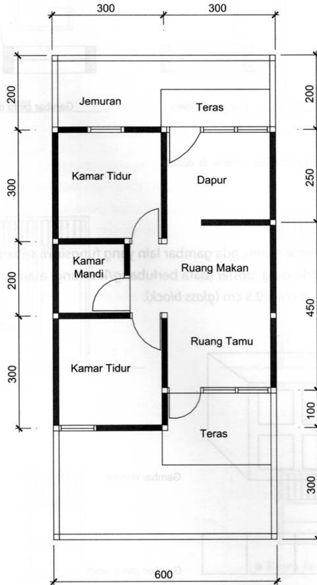
■ Gambar denah yang telah dilengkapi pintu dan jendela

difference in strength between a rice fired brick and a gas fired brick is statistically significant, and of concern for earthquake safety. The contrasting features are in the cities developed from the different brick manufacturing processes. Padang in Western Sumatra and Yogyakarta in Java have a very high percentage of masonry dwellings of a very similar design, such as shown in Figure 8, but mainly with low rise structures housing a single family.