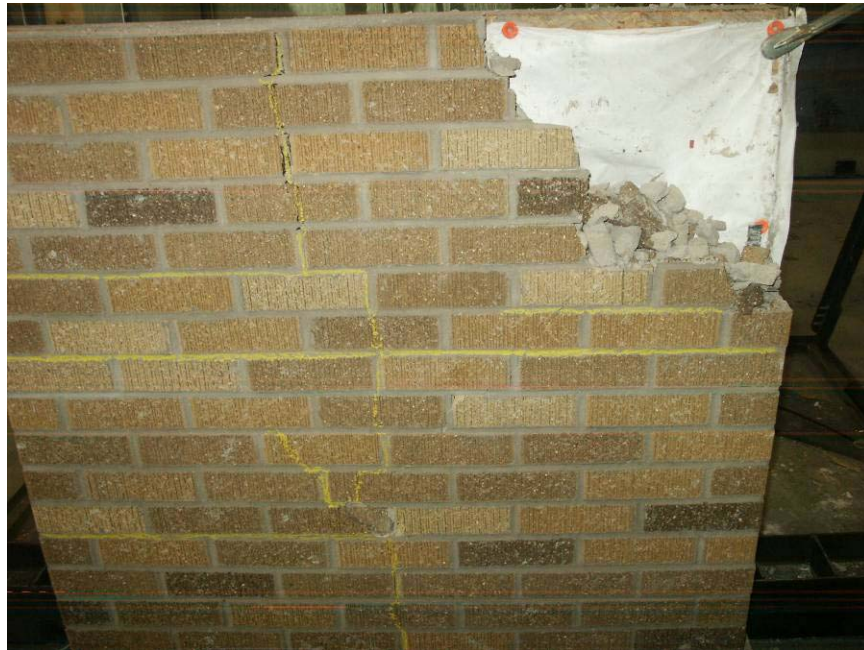
Figure 5 - Brick Veneer Cracking and Failure from 40 N (9 Lb) 108 km/hr (67 Mph) Missile Shot at Corner of Previously Tested Panel

The third brick specimen was of identical construction to the first specimen. It did not have any mortar around the sides and top, as the second specimen did. The first shot on this panel was a 40 N (9 lb) missile at 109 km/hr (68 mph) in the center of the panel. There was significant cracking of the brick veneer and a 38 mm (1-1/2 in.) penetration of the missile into the brick veneer (Figure 6). There was a vertical crack that went from 3.2 mm (1/8 in.) wide at the top to 0.8 mm (1/32 in.) wide just above the point of impact. The brick face texture, including the head joint, was visible in the end of the missile (Figure 7). After this test, the top portion of the panel was torn down so the impact area could be examined. There was minor scuffing of the weather-