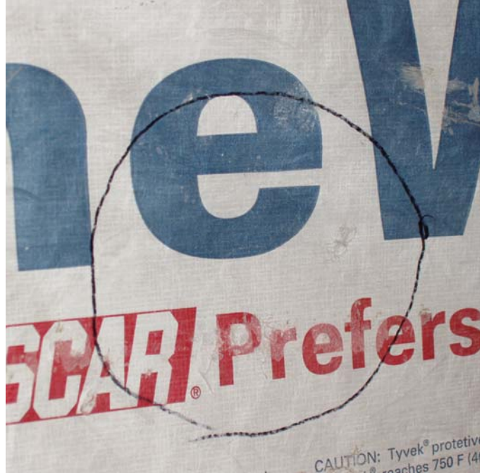
Figure 11 - Weather-resistant Barrier after 40 N (9 lb) 127 km/hr (79 mph) Missile Impact