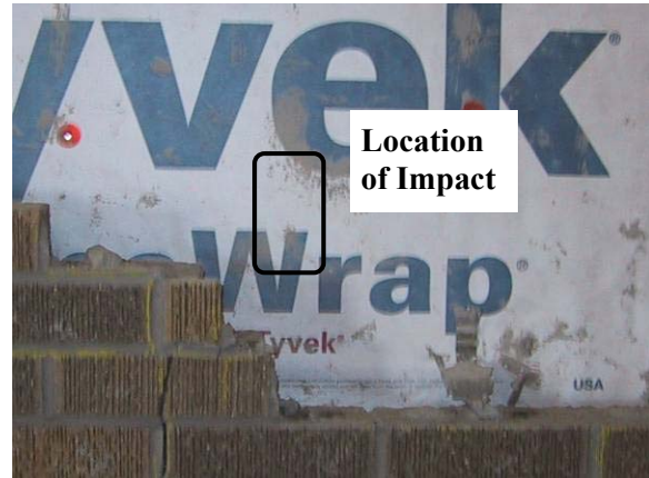
Figure 2 - Weather-resistant Barrier After 2 nd Shot of 40 N (9 lb) 56 km/hr (35 mph) Missile

The second specimen had a band of mortar approximately 75-100 mm (3-4 in.) around the sides and top that filled the air space. This mortar band was not specified, but was mistakenly put in by the mason. The effect of the presence of this mortar is unclear. It could be argued that the additional mortar helped the panel behavior by providing more support for the brick veneer. It could also be argued that the mortar hindered the performance of the brick veneer by adding stiffness. The increased stiffness would increase the natural frequency of the brick veneer. Impact loads will cause a greater force on stiffer structures than they will on more flexible structures.