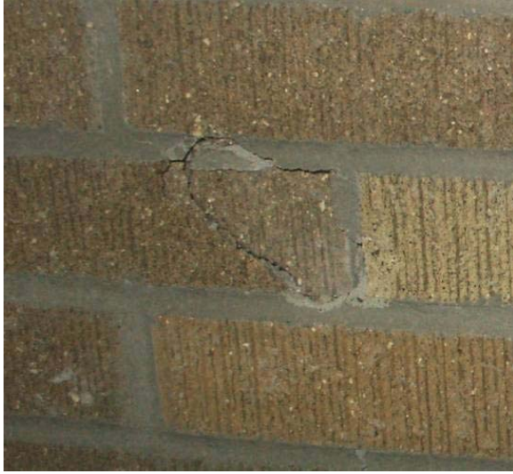
Figure 3 - Penetration of 40 N (9 lb) 88 km/hr (55 mph) Missile