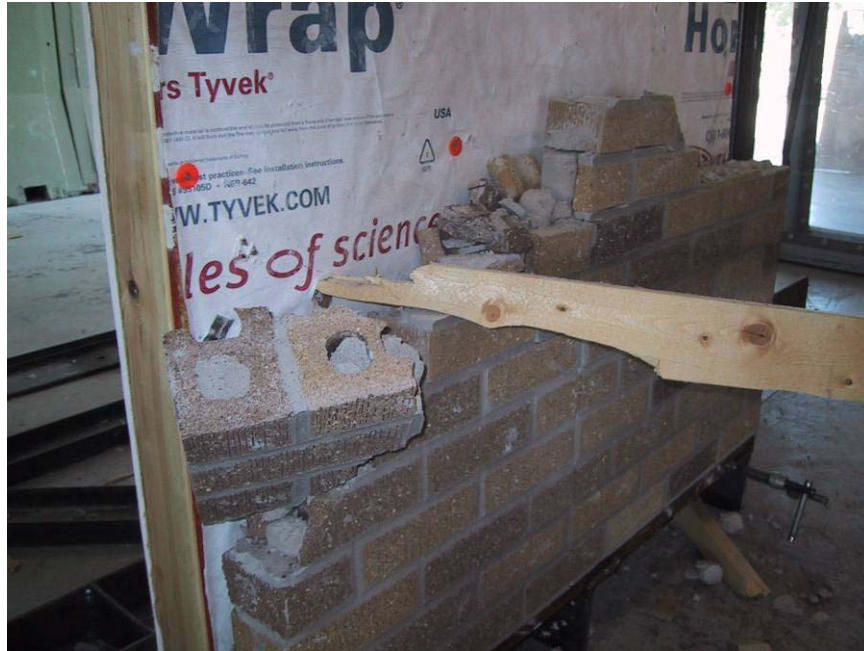
Figure 8 - Damage from 40 N (9 lb) 122 km/hr Missile