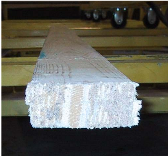
Figure 7 - Impact End of Missile After 109 km/hr (68 mph) Shot

The remaining lower portion of the panel was impacted with a second missile traveling at 122 km/hr (76 mph) in the lower left hand corner. The point of impact was one course above the lower row of ties. The brick corner was shattered, and there was a large vertical crack in the veneer. The missile split upon impact, with one piece penetrating about 25 mm (1 in.) into the sheathing, Figure 8. No cracks were present in the gypsum wallboard.