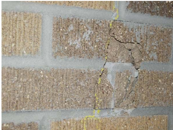
Figure 1 - Missile Penetration, 2 nd Shot of 40 N (9 lb) 56 km/hr (35 mph) Missile

damage to either the weather-resistant barrier or the sheathing (Figure 2). Thus, it is clear that brick veneer is very capable of resisting a hurricane missile of 40 N (9 lb) at 55 km/hr (34 mph).