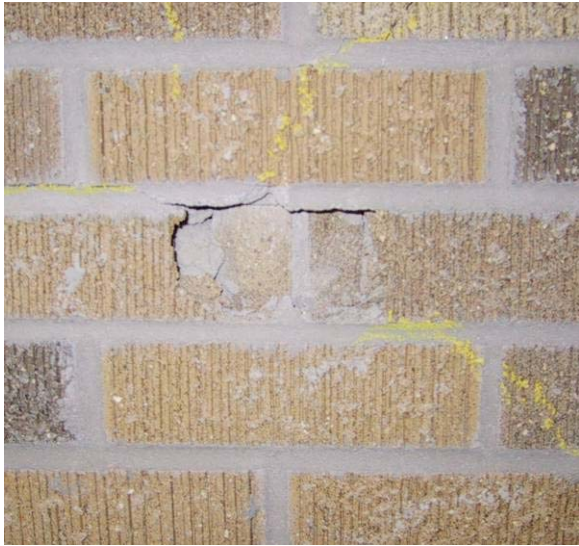
Figure 6 - Missile Penetration and Panel Cracking, 40 N (9 lb) 109 km/hr (68 mph) Missile

resistant barrier and no damage to the sheathing. A shear crack was visible through the thickness of the brick below the point of impact. The crack appeared to be at about 45° to the face of the veneer.