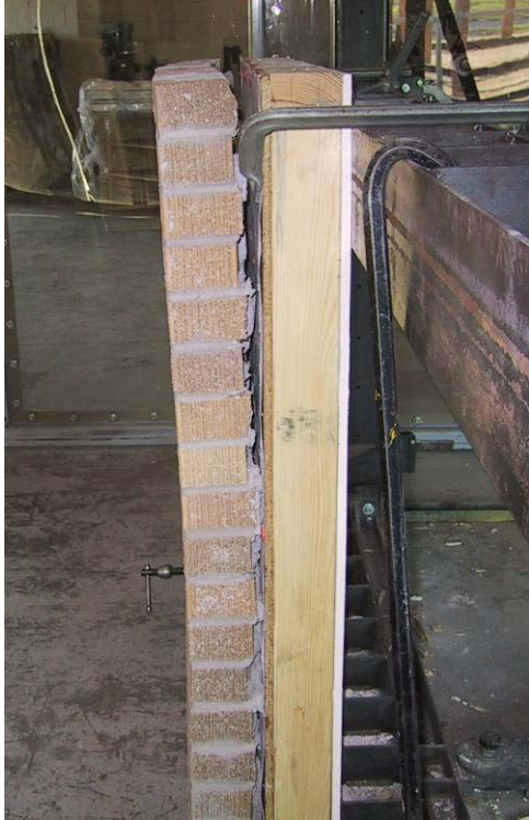
Figure 10 - Side View of Veneer after Impact with a 40 N (9 lb) 127 km/hr (79 mph) Missile