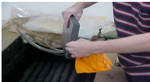
Figure 8 - Top Gauge Blotting Only

Deformations on control blocks left inside the laboratory, and not submitted to the saturated and dry conditions of the ASTM C426 test, were also measured for nearly 90 days.