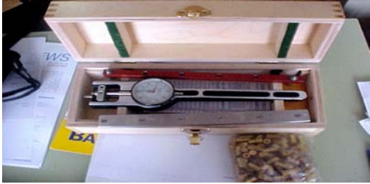
Figure 1 - Multi-Length Strain Gauge

23 ± 1 °C and 50 ± 5 % relative humidity. Figure 4 shows the procedure for mounting gauge discs on the sides. Figure 5 shows the test procedure and Figure 6 shows a half-shell specimen ready to be tested.