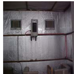
(C) controlled room