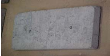
Figure 6 - Half Face-Shell Specimen With Side Gauge Points

Although the ASTM C426 procedure permits top and bottom gauges, they are not used very often for concrete blocks. Hence, few experiments with this kind of reading have been reported. During the several phases of this study, some care was taken to improve the procedure. The whole-block specimen with top and bottom gauges was shown to be inadequate. Testing a face-shell specimen with top and bottom gauges seems to be adequate if care is taken. Figure 7A shows a gauge disc glued to the top of a whole block and Figure 7B shows a gauge disc on the tops of face-shell specimens.