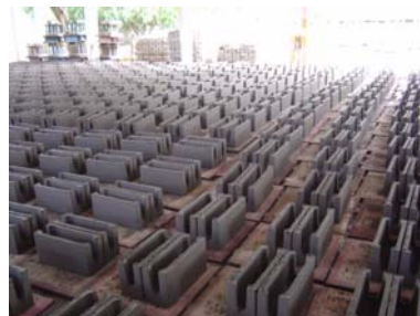
Blocks spread over the floor for “wet” cure