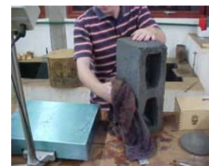
(D) block blotting with damp cloth before weighing