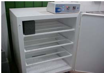
(A) drying oven