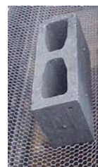
(C) block draining over a steel mesh