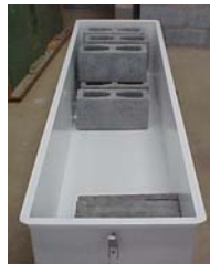
(B) cooling chamber