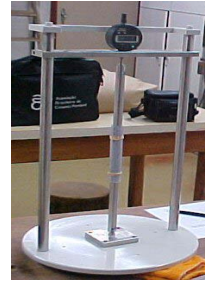
Figure 2 - Comparator For Top Readings