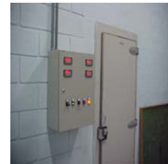
(D) temperature and humidity controls