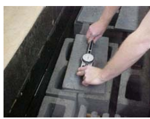
(B) initial saturated reading