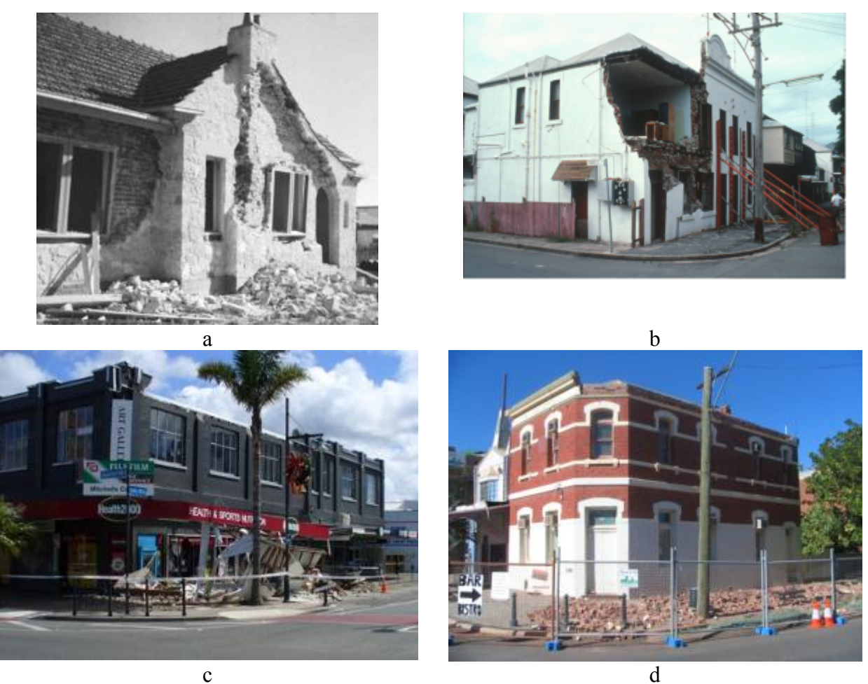
Figure 1: Representative examples of damage to URM buildings in past New Zealand and Australian earthquakes: a) Damage to stone veneer house in the 1954 Adelaide Earthquake [2]; b) Out-of-plane wall failure in the 1989 Newcastle earthquake; c) Toppled parapet in the 2007 Gisborne earthquake; d) Toppled parapet in Boulder after the 2010 Kalgoorlie-Boulder earthquake

Figure 1(d)). There were no fatalities but two people were treated at Kalgoorlie Hospital for minor injuries resulting from the earthquake [5].