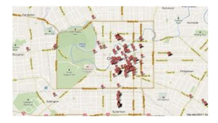
Figure 5: Location map of URM buildings demolished in the Christchurch CBD (as at 25 July 2011)

There have been over 8400 earthquakes and aftershocks associated with what is referred to here as the '2010/2011 Canterbury earthquake swarm'<sup>1</sup>. This earthquake swarm has resulted in a number of different earthquakes and/or aftershocks that have caused damage, with the most notable events being on 4 September 2010, 26 December 2010, 22 February 2011 and 13 June 2011. In the 4 September 2011 earthquake almost all major structural damage occurred to URM buildings, with full details reported by [9]. Damage in the 22 February 2011 earthquake was far more severe, and with subsequent aftershocks has led to the demolition of at least 224 buildings (as of 25 July 2011), of which 85% were constructed of URM. A listing of these demolished building was reported by [10] and the location of demolished URM buildings in the Christchurch Central Business District is shown in Figure 5.