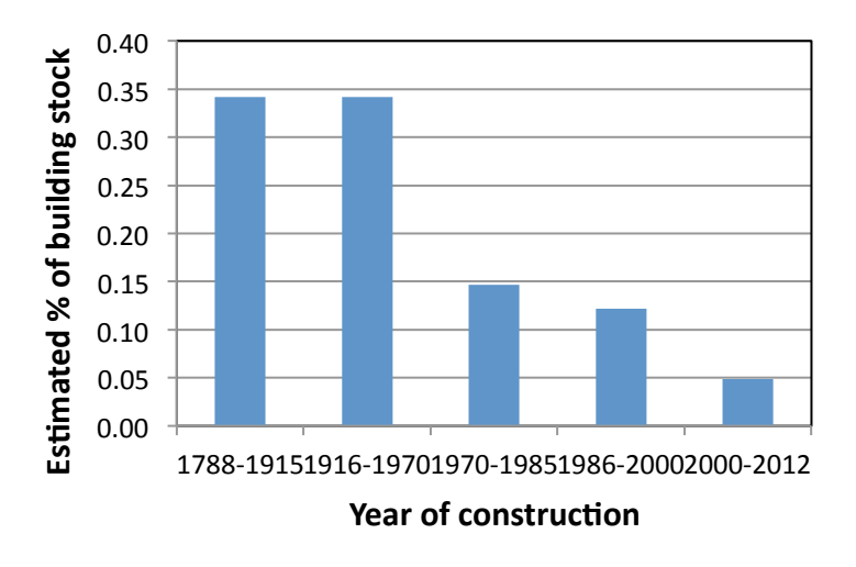
Figure 3: Approximate year of construction of buildings in Adelaide CBD

Raw data obtained from Adelaide City Council shows that an estimated 35% of current buildings in Adelaide City were built before 1915 (see Figure 3). It is conceivable that almost all of these buildings and many of the buildings constructed after 1915 were made of unreinforced masonry material.